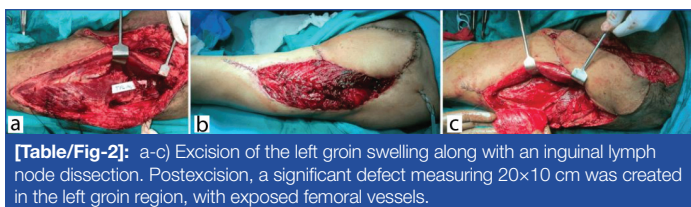
[Table/Fig-2]: a-c) Excision of the left groin swelling along with an inguinal lymph node dissection. Postexcision, a significant defect measuring 20×10 cm was created in the left groin region, with exposed femoral vessels.

A pedicled chimeric left TFL perforator flap was harvested to address the large defect and protect the vital structures. The surgical approach involved making an incision 2 cm medial to a line drawn from the Anterior Superior Iliac Spine (ASIS) to the lateral border of the patella. The incision was deepened through the subcutaneous tissue and the deep fascia was incised to identify the rectus femoris muscle. No significant perforators were found between the septum's rectus femoris and vastus lateralis muscles. A single dominant TFL perforator was visualised approximately 10 cm distal to the ASIS after extending the incision proximally. The entry of the perforator into the skin was confirmed, and the TFL muscle was elevated off the perforator. A skin paddle measuring 20×10 cm was marked around the perforator, and the flap was islanded. The bleeding was assessed and found to be satisfactory, allowing the flap to be tunneled below the rectus femoris muscle into the defect.