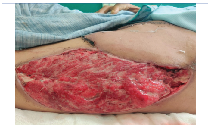
[Table/Fig-3]: Follow-up image showing donor site with good granulation and healthy flap.

The patient's postoperative course was uneventful. Daily dressing of the donor site was performed, with the flap showing good viability and no signs of infection or dehiscence [Table/Fig-3]. The patient was scheduled for subsequent follow-up and adjuvant therapy as part of the comprehensive management plan for melanoma.